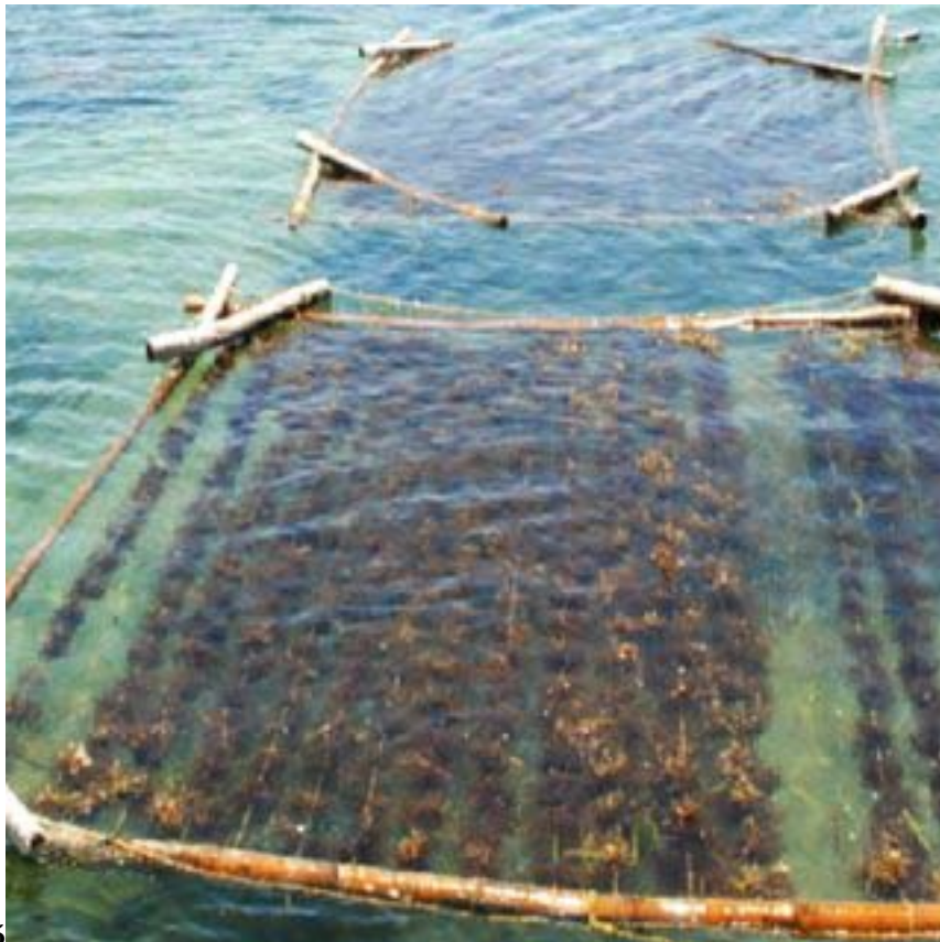
Figure 4: Figure 4 :