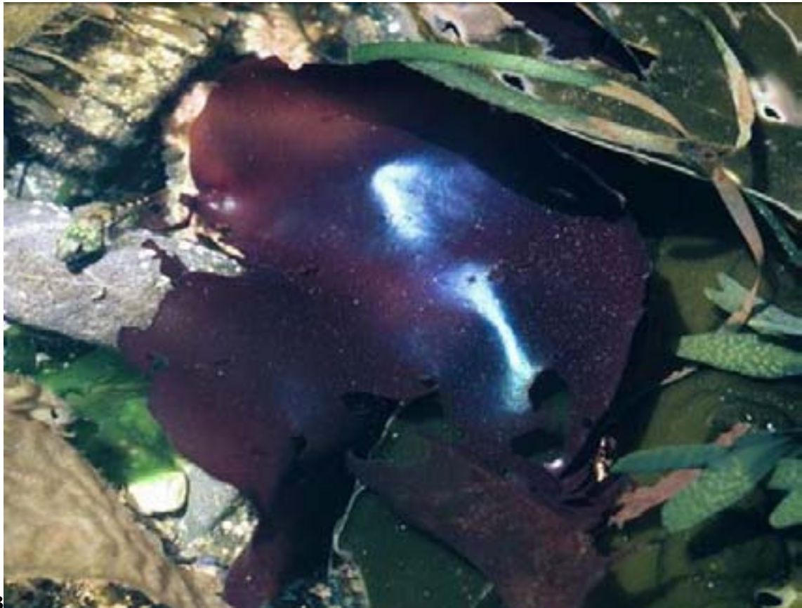
Figure 2: Figure 2 :