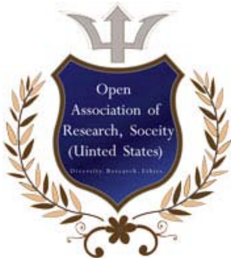
Figure 1: Fig

In addition, the changes in the system could directly affect the software operation. The software should be developed to accommodate changes that could happen during the post implementation period. expansion and contrast properties compared with many of the known results in the literature. According to the step construction proposed in this paper, the VCS with general access structure can be constructed by only applying (2, 2)-VCS recursively, regardless of whether the underlying operation is OR or XOR, where a participant may receive multiple share images. This result is most interesting, because construction of XOR for general access structure has never been claimed to be possible before. Using Cryptography scheme, image is transferred in a secure mode through the trusted center. Simultaneously, the quantum key is generated in the trusted center and it is distributed to the sender and the receiver. By, this authentication the third party cannot interfere in the middle during the data transfer. The proposed construction can generate optimal OR and XOR for each qualified set and our schemes can also reduce the APE in the most cases compared with the known results in the literature.