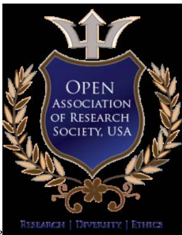
Figure 1: Fig. 2 :