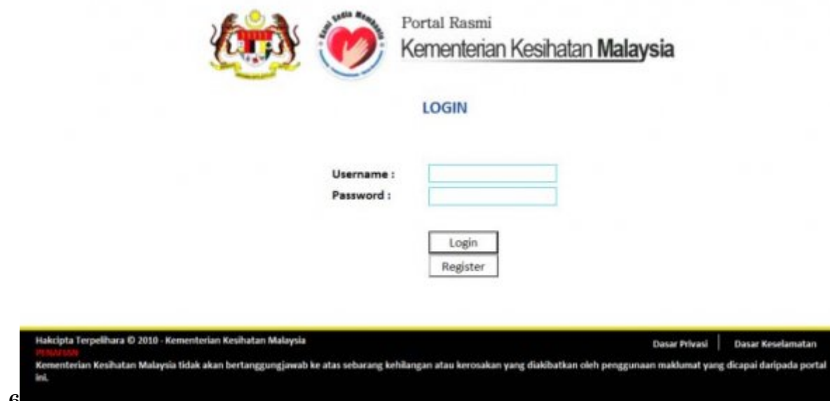
Figure 2: Figure 6 :