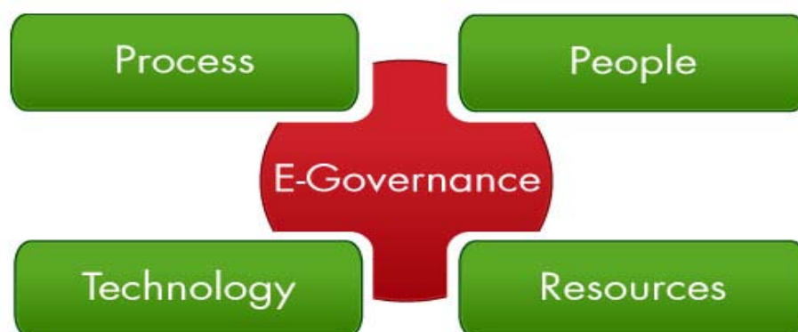
Fig. 1: Electronic government needs

New developments to lead to a lot of amendments to the e-government model, which is suitable to the harmonic framework updates Data input to the electronic government (Government Interoperability Framework) to match sources and format the new data with back-end systems to the government.