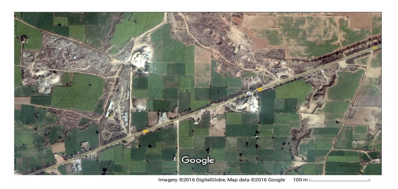
Fig. 2: Location of SONDH village on Taoru road using Google Map

Note: At present, Raigar, Mochi, Weaver (Jullaha) (BC) and Julaha (SC) and Badi Castes find a mention in the list of both Scheduled Caste and Backward Classes. The persons belonging to these Castes who do not cover under the Scheduled Caste being Non- Hindu and Non-Sikhs can take the benefit under the Backward Classes only.