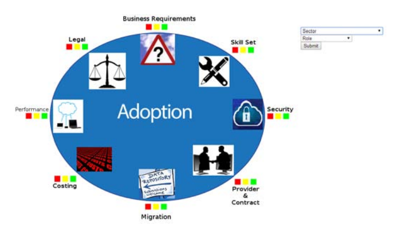
Figure 3: PaaS Adoption Dial

That application was built to include several parts that included an introduction to the application, the PaaS Cloud Adoption Dial and PaaS Adoption Recommendation Results.