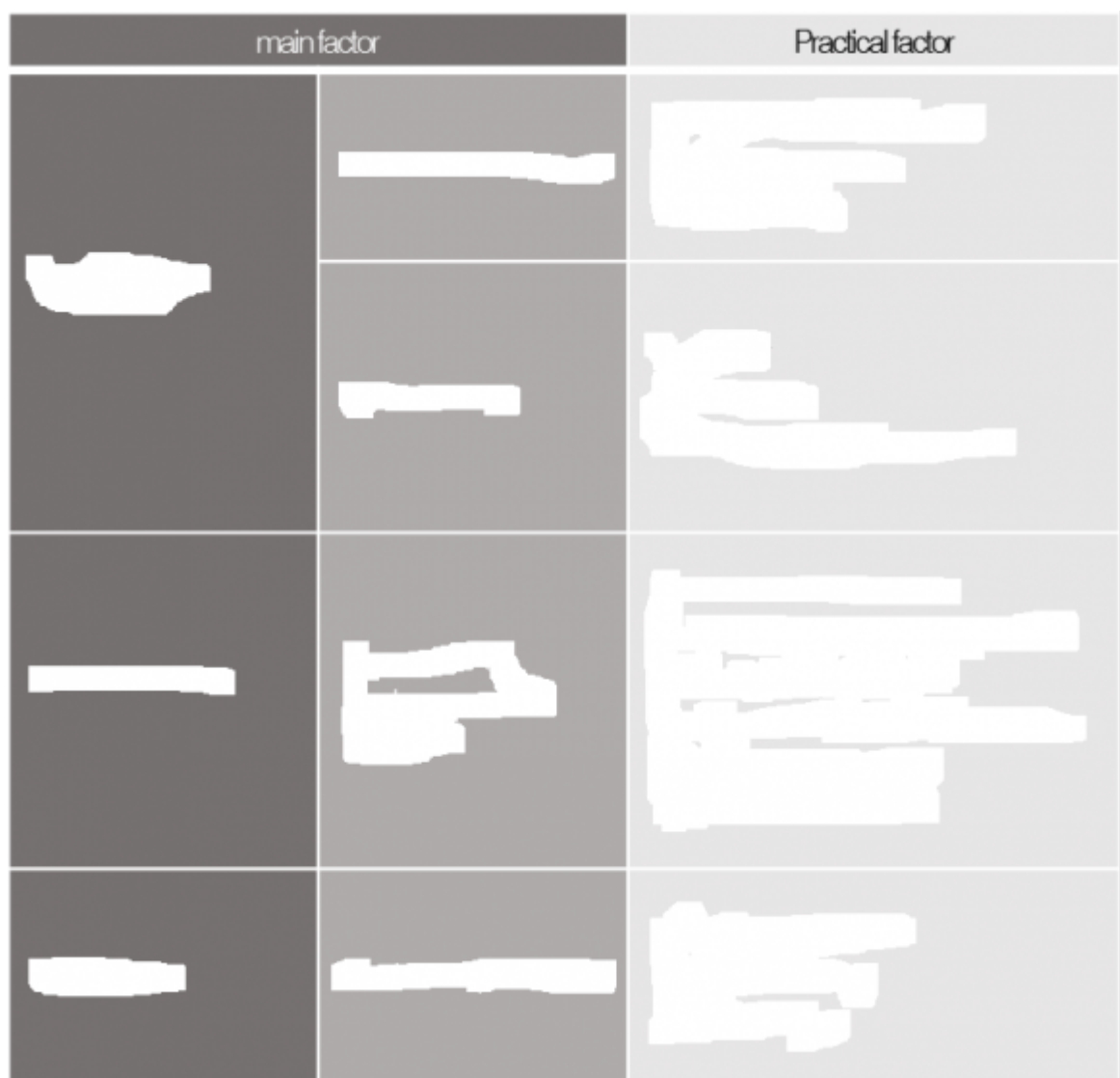
Figure 1: O

Sustainable Producing Process using 3D Printing 1