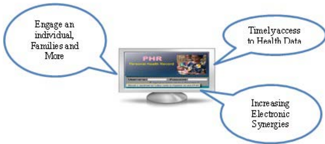
Figure 1: Fig. 1 :

PHR can benefit individuals and their care givers, health care providers and societal/ population health benefits. In the proposed system all information related to the health profile of an individual is stored in database. So, implementing this will be really helpful to the people below poverty line. In future, data mining techniques can be adopted to forecast diseases and precautionary measures can be taken. Even it is possible to develop an expert system to diagnose the disease of the patient and given prescription accordingly. 1 2 3