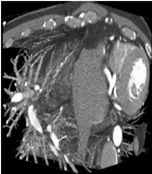
Figure 5: Sample MRI image and its colored version

Textures of a medical image play an important role in support of a surgeon to decide the angle at which the surgical blade should be used to make incision so that the loss of blood due to surgery is kept minimum. A case study was carried out to verify the validity of the algorithm and the result of the study presented in Fig. 5, which is self-explanatory.