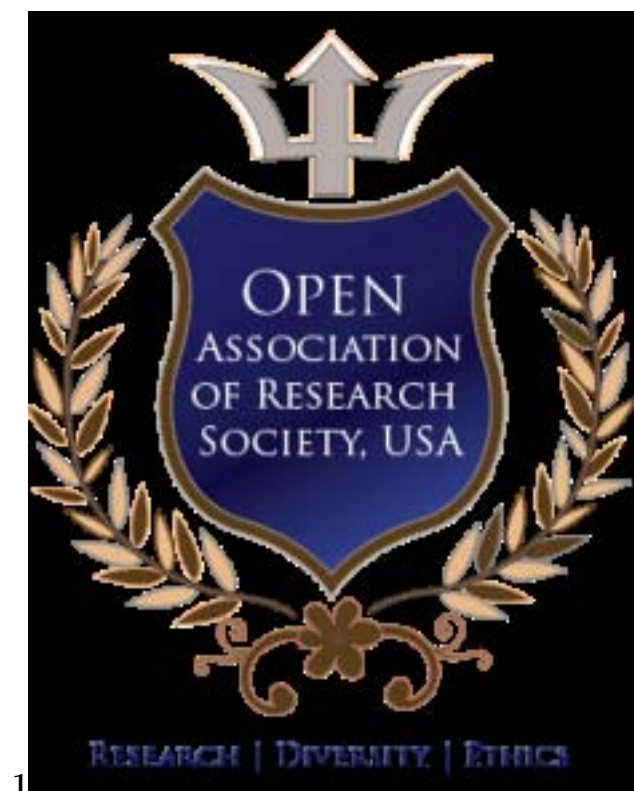
Figure 1: Figure 1 :