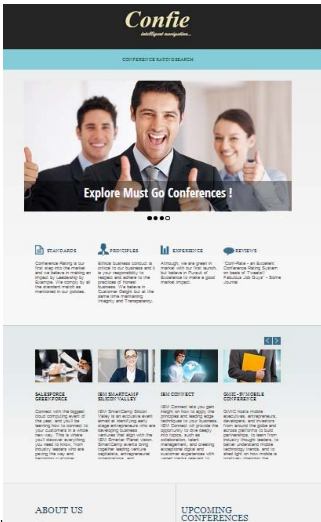
Figure 3: Figure 3 :