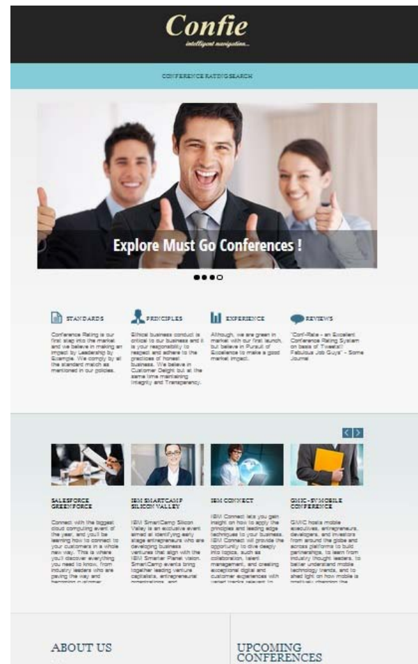
Figure 2 : Re-designed User Interface

We decided to re-design the UI (figure 2) to make it look more appropriate and authentic.