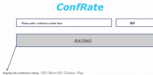
Figure 1 : Application Prototype

application is to display the ratings of conference based on the user feedback on twitter; thus, a "Rating" button was added to the prototype.