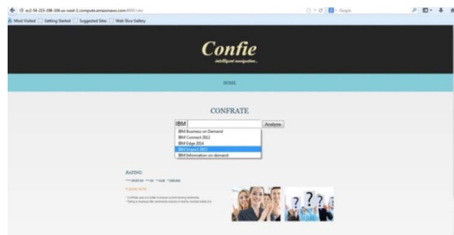
Figure 5 : Conference Search

Figure 5 shows that the user looks up for conferences and the results related to that particular conference are displayed dynamically.