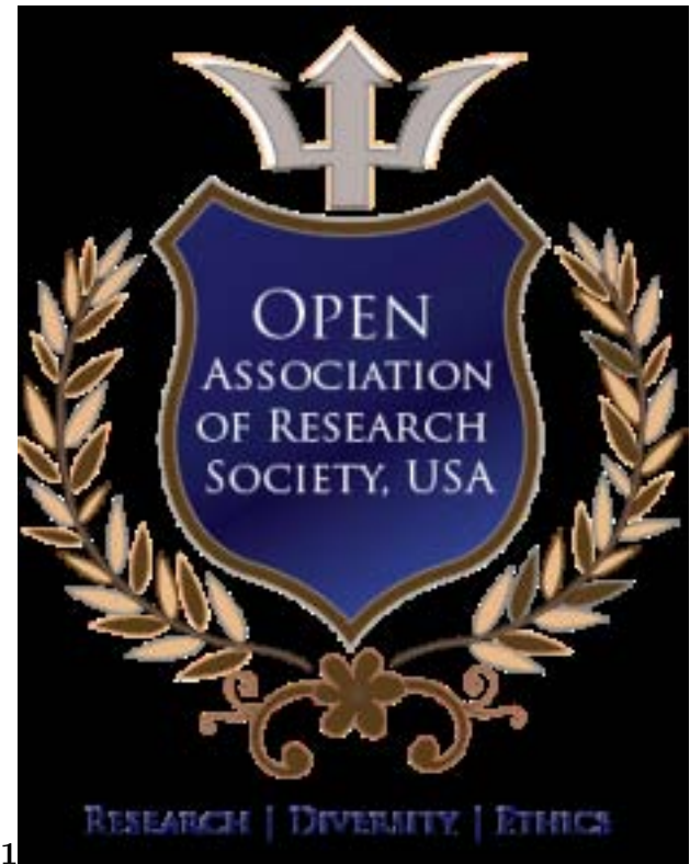
Figure 1: Fig. 1 :

In order to satisfy multiple functional and nonfunctional constraints, suitable concrete services need to be selected for web service selection. Due to the complexity involved in the problem, we have presented an algorithmic approach for solving the optimal service selection problem by considering a stochastic optimization algorithm called SOMA and specially designed it suitable for WSS. Our approach is designed to accelerate the detection of optimal configuration at rapid convergence. The algorithm guarantees the resulting composite web service with maximal overall QoS that strictly conforms to the QoS constraints and user requirements. As a part of our future work, the algorithm has to be improved in order to survive in a ubiquitous environment. The mobility, adaptability and user preferences are to be formulated automatically as constraints. 1