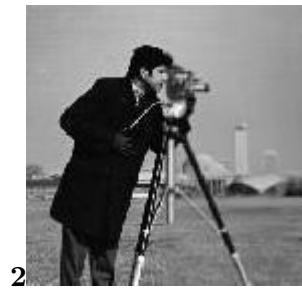
Figure 4: Figure 2 :