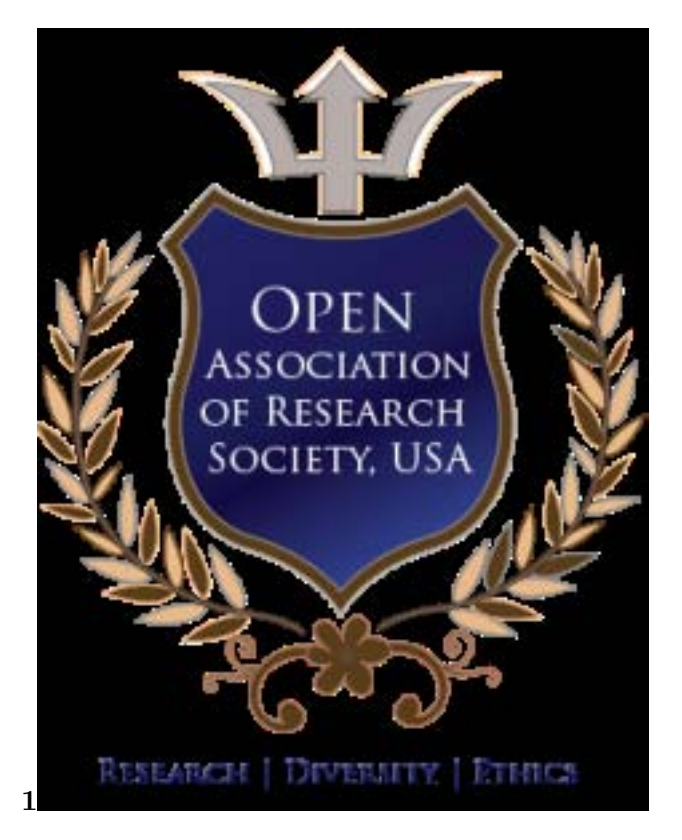
Figure 1: Fig. 1 :