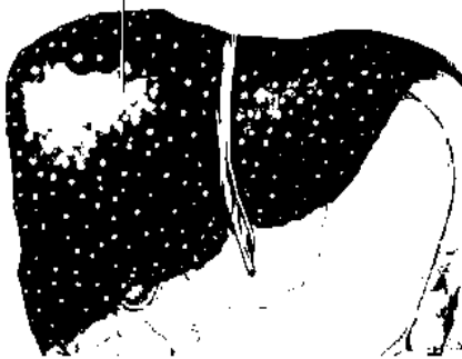
Fig.1 Snapshot of Cirrhosis of the Liver